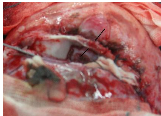
Fig. 2: Intraoperative photography confirms the basal mass which was in continuity with nasal mass (black line) and displaced two ethmoidal cells laterally

Teratoma is the most frequent congenital tumor with early presentation at birth [3] . Head and neck teratomas account for 2-9% of all teratomas [2] .